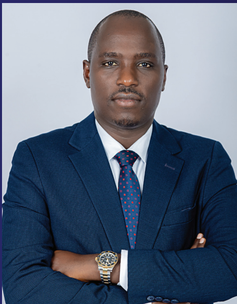
DKT. DOTO MASHAKA BITEKO

Before entering politics, he was actively involved in the education sector and held leadership roles in the Tanzania Teachers' Union. Since becoming a Member of Parliament in 2015, he has held several key government positions including Deputy Minister and Minister of Minerals, and now serves as the Deputy Prime Minister.